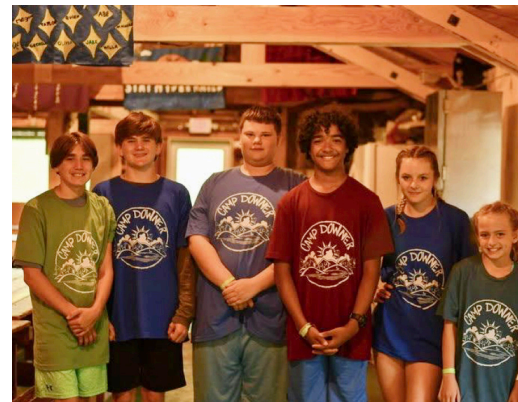
Camp Downer scholarship participants.

This year, Youth First Mentoring worked with local and regional partners to provide cultural enrichment opportunities to our youth. Mentor pairs had opportunities to watch Uganda's Dance of Hope performance at the Barre Opera House, spend the day learning about Vermont and American history at the Shelburne Museum, attend Mountaineers baseball games, and enjoy our natural resources with passes provided by the Vermont State Park system. We thank our partners for their generous support of our mission!