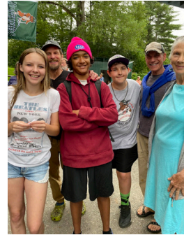
Right, mentors and mentees at a Mountaineers baseball game.

Hosted community-building events at locations around the region: Wrightsville Reservoir, Mountaineers, Lamb Open House at Center Farm and more. We look forward to adding more opportunities for our mentors and mentees to gather as a group in the coming year!